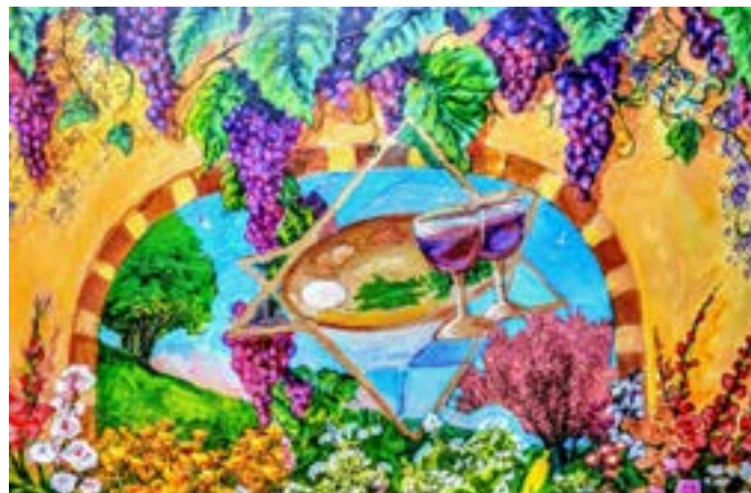
Passover in Sonoma (c) 2015, Nina Reimer Oil/mixed media on canvas