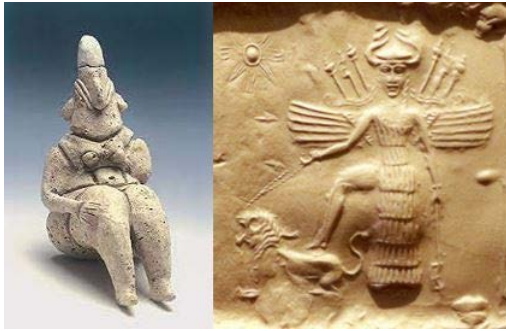
Images: Yarmukian Goddess, Sha'ar HaGolan, Northern Israel ca 6400 BCE (L) Goddess Inanna/Ishtar on an Akkadian Empire seal, 2350 BCE, modern day Iraq (R)