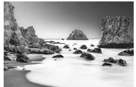
"Dawn at McClure's Beach"

Poetry is the language of the soul. It's a powerful technique to access your inner wisdom and express it with power and beauty. In this workshop we will explore: