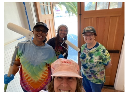
Energizing the Entry